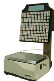
Euroscale 20 SS 110T