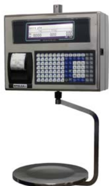
Euroscale 22 RLI Inox 98T