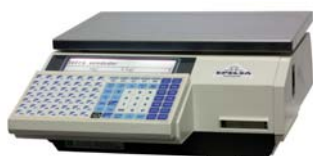
Euroscale 20 RLP ABS 98T