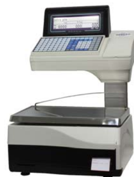
Euroscale 20 RL 98T