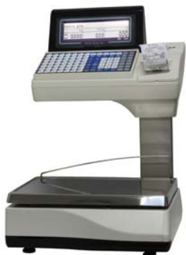
Euroscale 20 V14 98T

The Euroscale range of GRUPO EPELSA consists of a variety of scales as shown below: