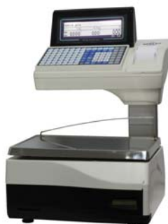
Euroscale 20 RLI 98T

Counter scale, double body, printer and labeller