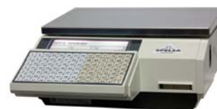
Euroscale 20 RLSS ABS 98T

Counter scale, double body, printer and labeller