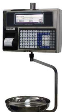
Euroscale 22 V14 Inox 98T