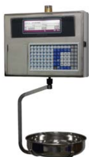
Euroscale 22 RL Inox 98T